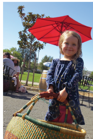
Healthy Habits start early

The December 8th market will be a joint event with the Shop Party group and the WEFM. The Shop Party will feature handmade gifts inside the round barn and the WEFM will be happening at the same time. The event will run from 10:00 a.m. to 4:00 p.m. Go to www.wefm.co for more information.