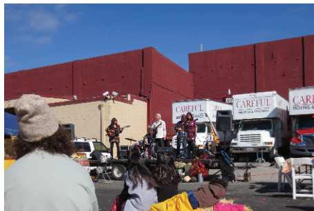
Local Music at WEFM

The market is blessed to have over 20 volunteers that show up to help set up and break down the