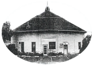
A CLASSIC AMERICAN NEIGHBORHOOD