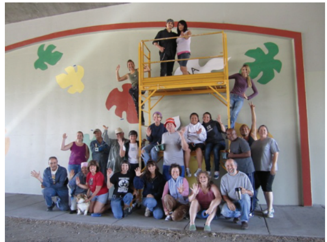
Current 9th St. Community Mural

Jim Curtis created other murals including the "Energy" mural under Hwy 12 at Olive/Railroad Ave. and the "The Endangered Species Welcome the Humans" mural on 5 th under 101 called . Caltrans removed 60 feet of both 9 th St. & 5 th Street murals when Hwy 101 was recently widened. Two pieces of the 5th Street mural remain but are now separated by a new decorative frieze. The two ends of the 9th Street mural endured until replaced by a new community mural project in 2011. The 9 th Mural no longer exists but the original art-